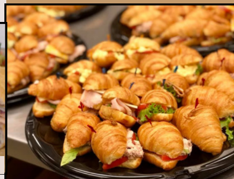
Shown: Mini Croissant Platter $45