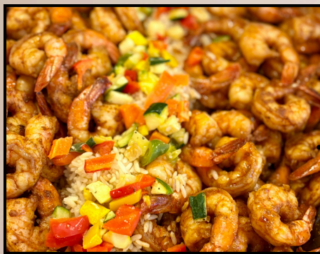
Shown: Grilled Summer Shrimp & Rice