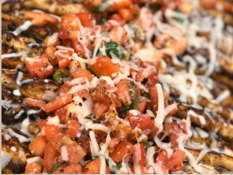
Shown: Summer Bruschetta Chicken