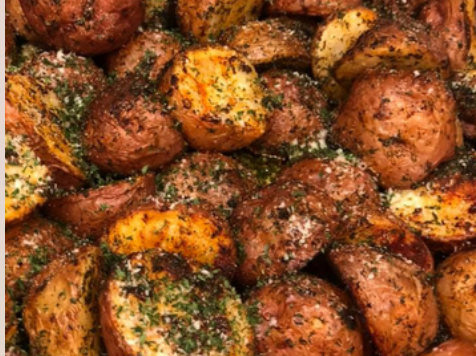
Shown: Roasted Potatoes